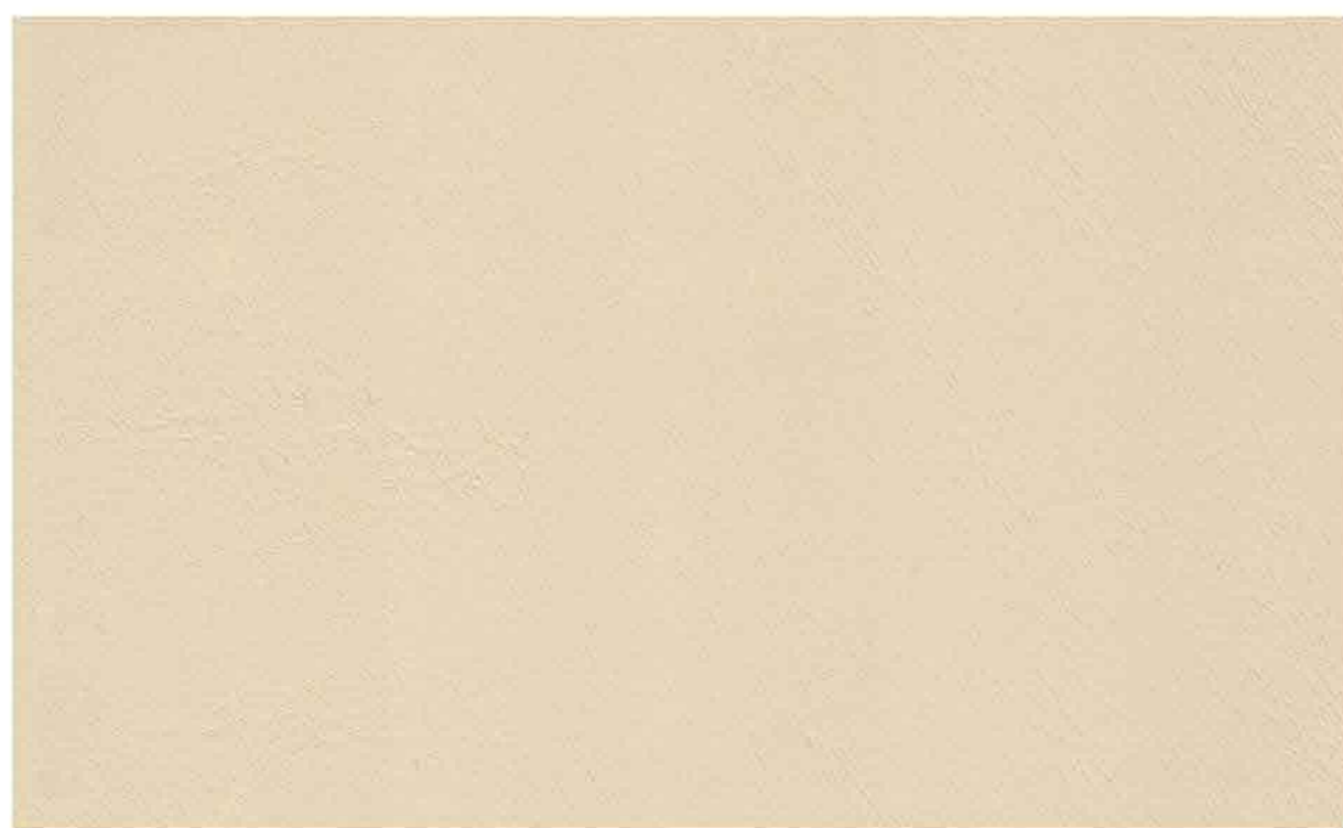
Classic Smooth-301 Cream